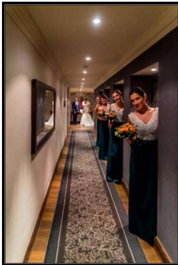
Bespoke Memento Wedding Service